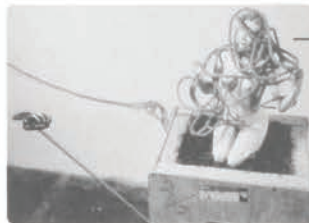
"the stubbornness of what remains when everything vanishes and the dumb-foundedness of what appears when nothing exists..."