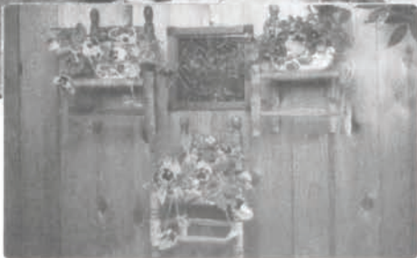
Worlds within worlds... Mexican chairs for children take a turn as potholders for pansies on a handmade fence.