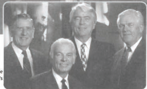
A rare photo of the so-called "Gelden Guild," the invisible Captains of Industry backing Büzköcke's embittered machinations.