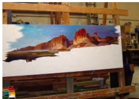
In-process detail of Big Landscape, Big West , 2006

Cerney chose the Moran work for Big Landscape, Big West because, he says, "If I'm going to do my version of a landscape painting, I can't do better than Thomas Moran." The painting's dramatic imagery and the horizontal format were well suited to Cerney's needs. He enlarged Moran's painting to cover the back wall of the gallery and then expanded it over the two adjacent walls. In front of the scene stand cut-outs of a family of four clad in 1890s garb and rendered on sheets of paper-coated plywood. The mother is at work at an easel painting the scene, the father sits resting on a rock, and the daughter clutches a handful of wildflowers as she stares in awe at the canyon. Outside the gallery, a boy peers at the scene with binoculars.