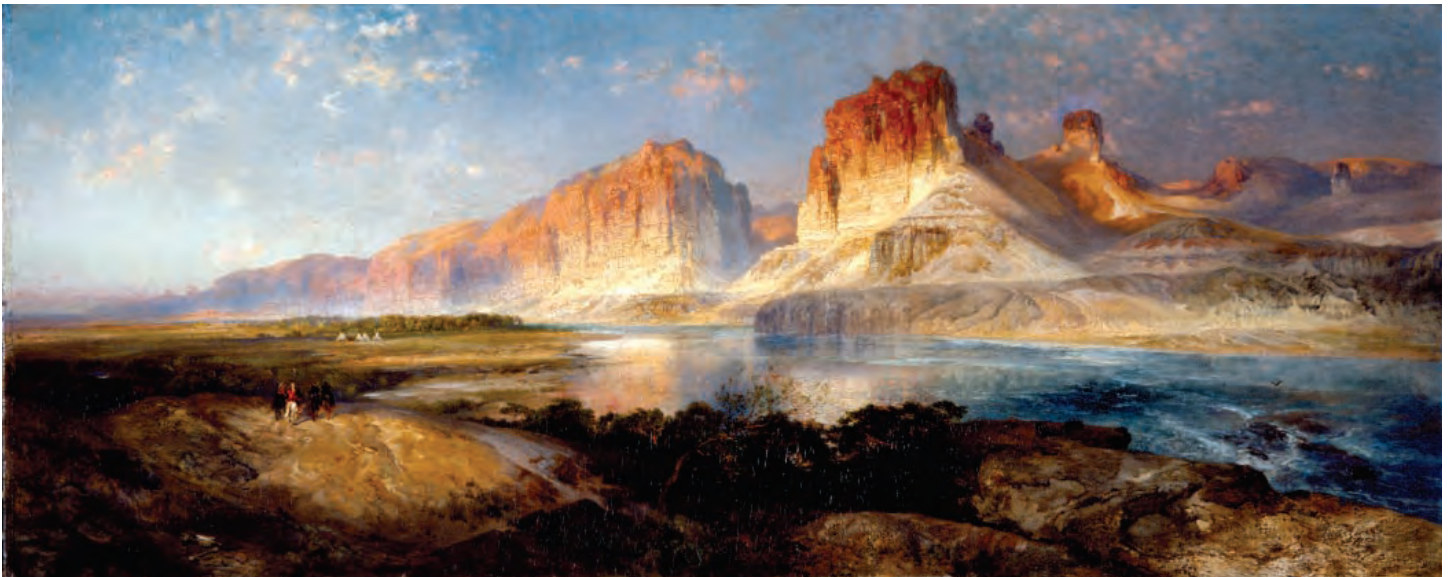
Thomas Moran, Nearing Camp on the Upper Colorado River , 1882